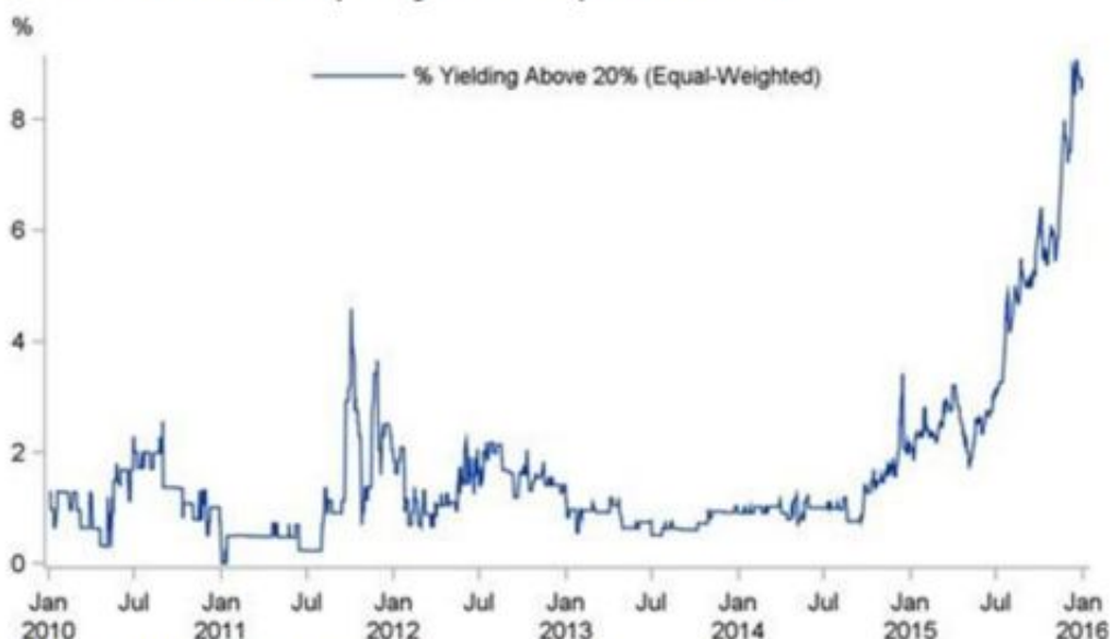
Exhibit 3: Share of HY debt yielding above 20% by notional amount

Artweaver Plus 7.0.4.15458 на русском полная версия - скачать полную версию на русском языке ... Скачать бесплатно Artweaver Plus 7.0.4.15458 + crack.. Artweaver Plus 7.0. 4.15458 Free Download is a complete-featured portrait device with a large set of predefined sensible brushes to paint creatively or just experiment. Artweaver 2020 Crack Free Download is appropriate for novices and superior customers. Cobra Driver Pack 2020 Crack ISO [Updated]