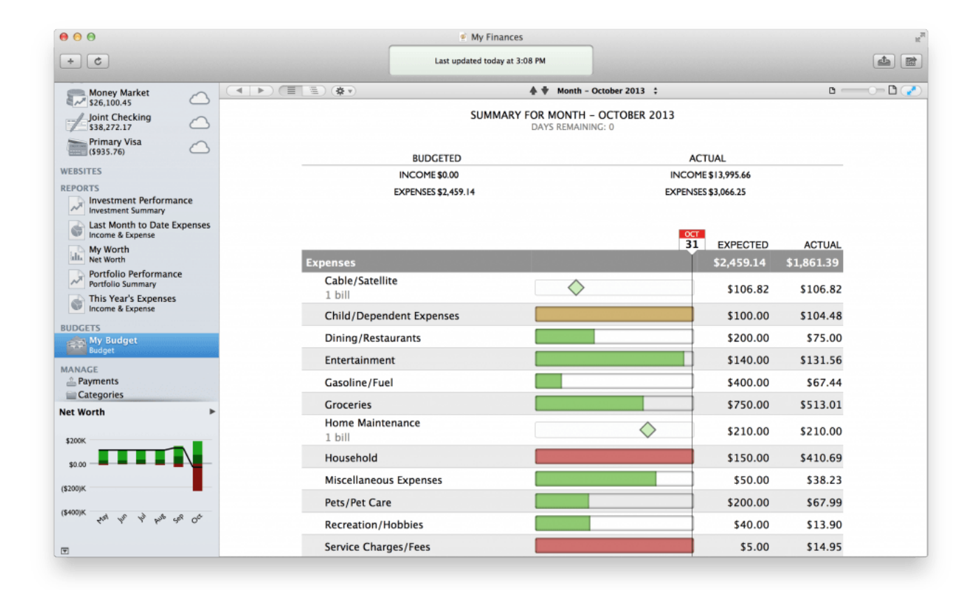
Best Personal Financial Software For Mac 2016